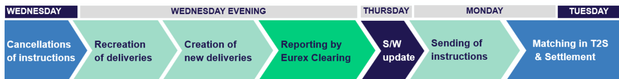
Figure 1 - High-level steps during UNO Wave 2 market activation

Eurex Clearing will in alignment with Clearstream perform a special processing to support the UNO Wave 2 market activation for markets Switzerland, the USA and Canada during the period from Wed, 29 Apr 2026 to Tue, 05 May 2026. After completing the End-Of-Day Processing for business day 29 April 2026 in C7 SCS, Eurex Clearing will internally process the software update for Release 5.5 in simulation. There are no direct impacts from this step for Clearing Members or Settlement Institutions. After Clearstream's confirmation of the completion of the link setup for impacted instruments in T2S and after completion of the software update, Eurex Clearing will send out all unsent instructions to CEU (and SIX SIS for cross-border transaction) on calendar day on 04 May 2026 1 .