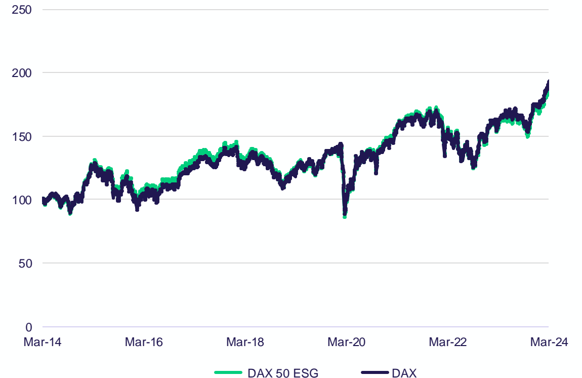
Performance (EUR TR): Mar 31, 2014 to Mar 28, 2024